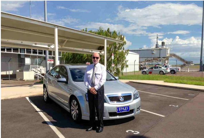
International Airport (Your flight departs 10:00 am)