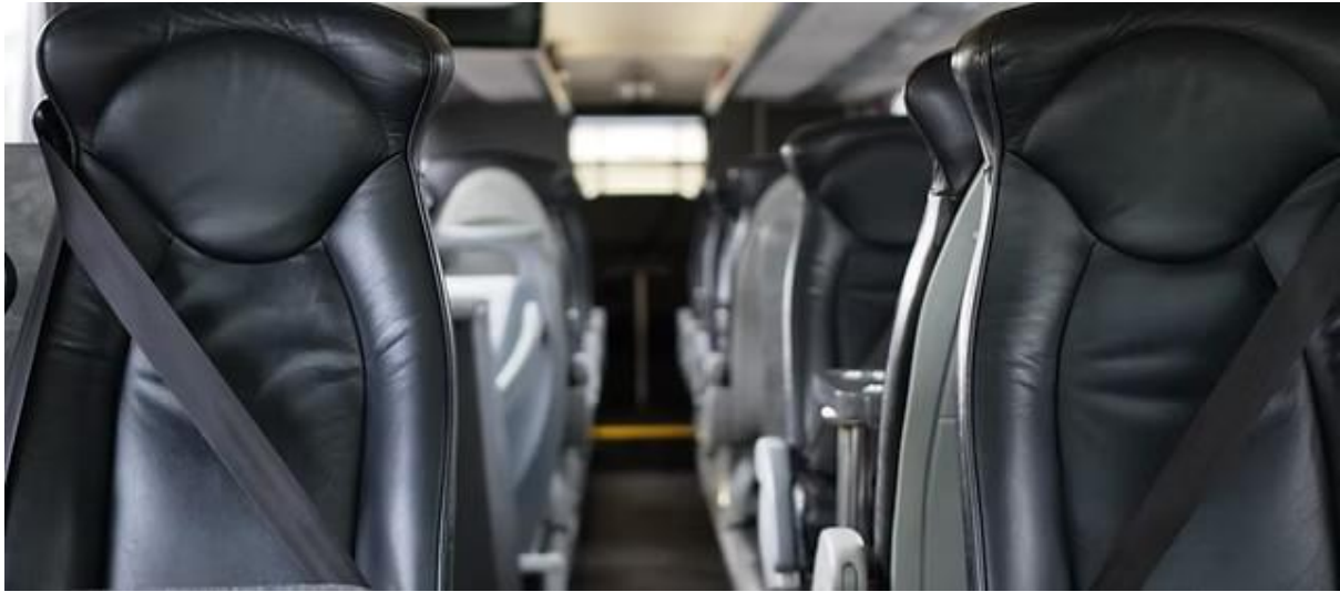
32 Seats – Aussie Driver Guide (No Toilet)

APSE Tours Pty Limited ABN: 17139354251 | Travel Lic. 2TA 071127 E: info@apsetours.com , www.apsetours.com Head office & Mail: 25 Hawkins St. Bucasia QLD 4750