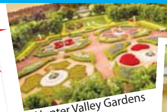
Hunter Valley Gardens approx. $21 pp