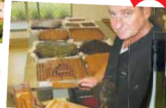
Visit Chocolate Factory