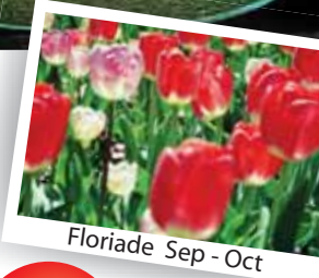
Floriade Sep - Oct

Departs: 8:00 am Returns 8:00 pm Every 3rd Sunday of the month (Special Sep – Oct : Every Sat & Sun)