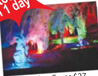
Jenolan Caves $27