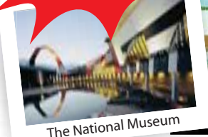
The National Museum