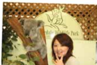
FREE Photo taken with koala