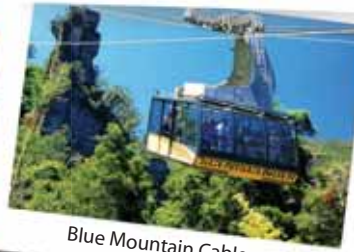
Blue Mountain Cableway $19